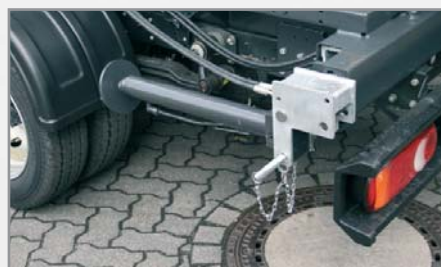
Hydraulic supports 90° foldable (transport position)