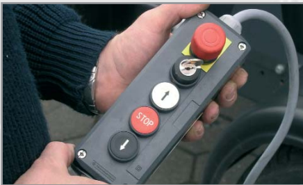
Electric control via cable operation