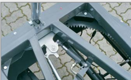
Infinitely variable, hydraulically releasable live ring lock

Wheels of the head piece laterally adjustable (optional)