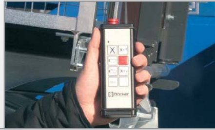
Hand-held radio transmitter for operation from the top end