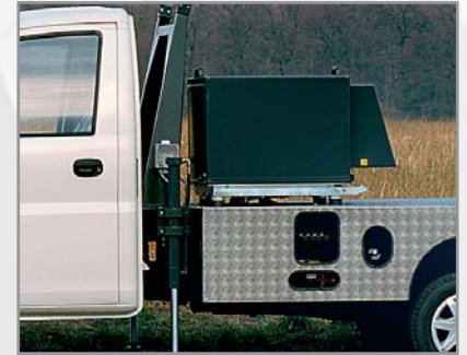
Noise protection hood (optional)