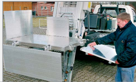
Side panels foldable 90°/180° and completely removable