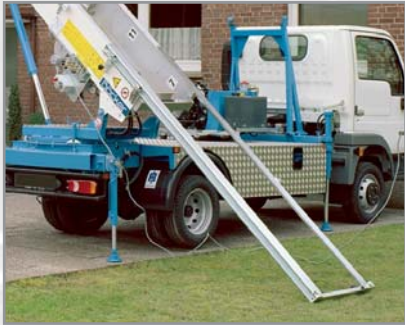
Infinitely extendable extension