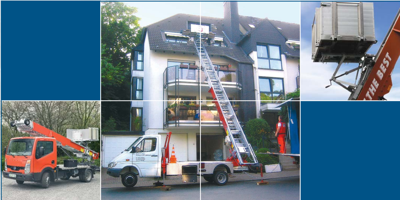
Agilo Furniture Lift