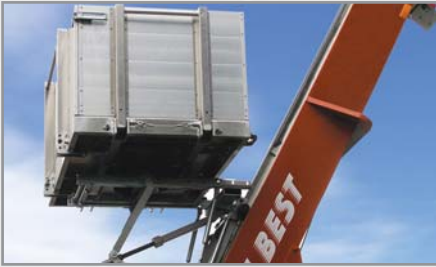
Infinitely variable, gas spring spindle 17–87° (optional)