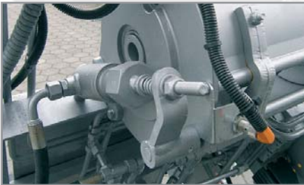
Automatic, hydraulic handle lock (optional)