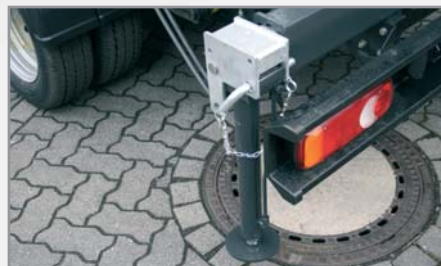
Hydraulic supports in two tubes