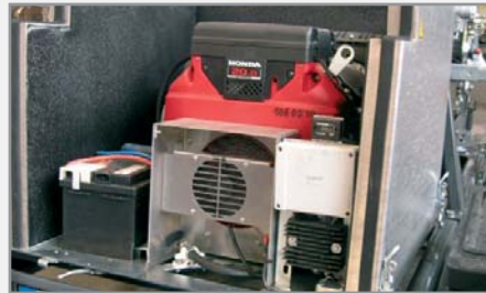
Extra powerful engines or PTO (depending on the model)