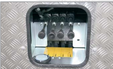
Control stand for hydraulic supports