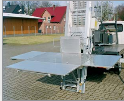
Completely plane platform surface